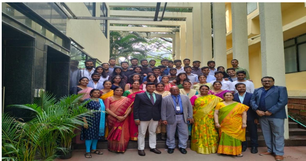
Figure 2: Group photo of Alumni with Faculty