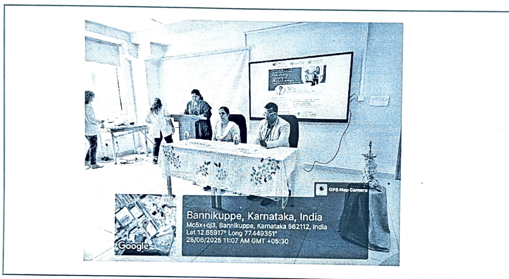
Pic 1 – Formal Event